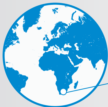
ABB provides the PSTX soft starter to the equipment manufacturer Xylem, in South Africa

With ABB's soft starters Xylem can make panels for industrial applications that pump water out of mines as deep as 3,500 m