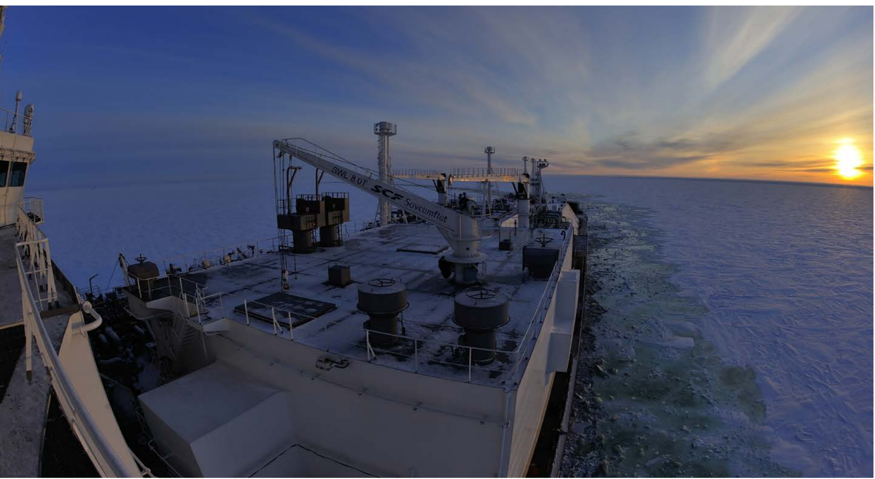
ABB technology driving the world's largest icebreaking Azipod® propulsion fleet

SCF Group, a leader in energy shipping, operates the world's largest ice-fleet powered by the pioneering icebreaking Azipod® propulsion.