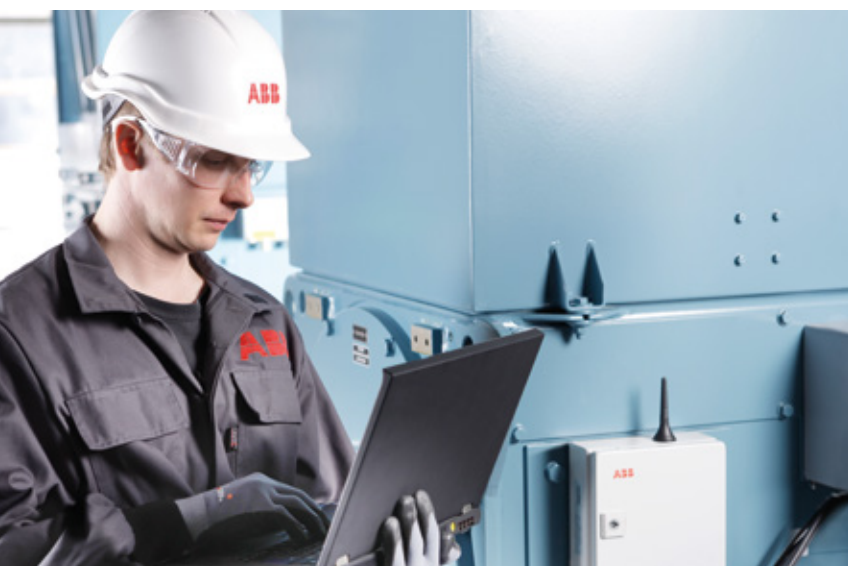
ABB has been manufacturing motors and generators for more than 100 years. This extensive experience provides a solid basis for the company's commissioning services.

All commissioning is performed by fully trained and certified engineers to ensure that the work is done in a safe and efficient way.