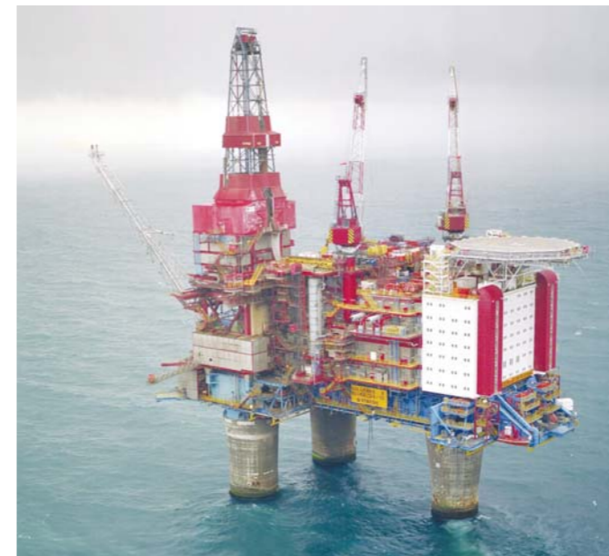
Gullfaks B began production on February 29, 1988.