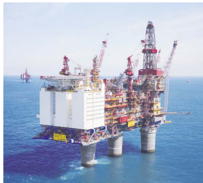
Gullfaks A began production on December 22, 1986.

The three platforms in the Gullfaks field have been in successful production since the mid- to late-1980's, when ABB installed the original control systems. Today, the field utilizes a combination of three generations of ABB control systems, including many of the original controllers installed over 30 years ago. Phasing out these first-generation controllers has been an important part of the upgrade project. To prepare Gullfaks for an extended lifetime through to 2030, another important goal has been to ensure that the total solution shall not limit the implementation of work processes, either offshore and onshore. In this way, strong focus has been placed on Integrated Operations (IO).