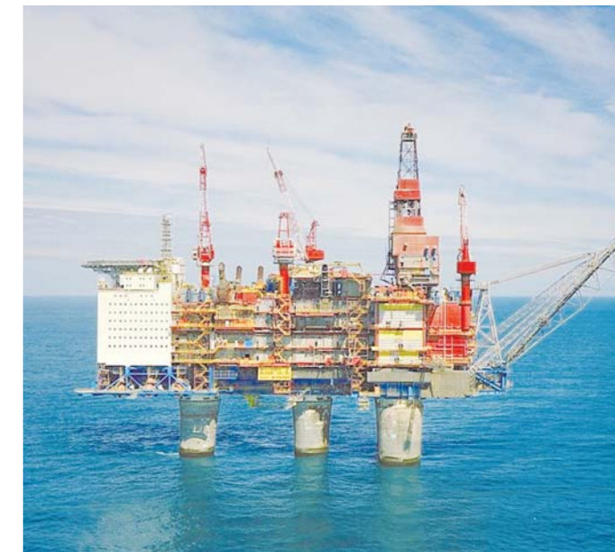
Gullfaks C began production on November 4, 1989.