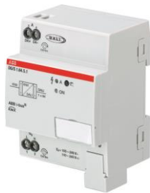
Fig. 1 The KNX DALI Gateway Premium.

More specifically, the KNX DALI Gateway Premium now allows the easy commissioning and integration capabilities using the ABB i-bus® KNX tool to be exploited to reduce the complexity of DALI installation. The integration of DALI devices with the ABB i-bus® KNX system also creates synergies that benefit markets where DALI is a vital feature.