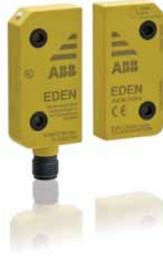
Eden OSSD non-contact safety sensor