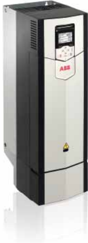
ACS880-01 R5 drive