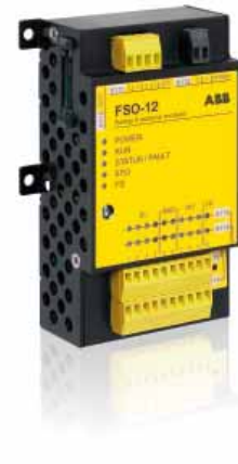
Safety functions module, FSO-12