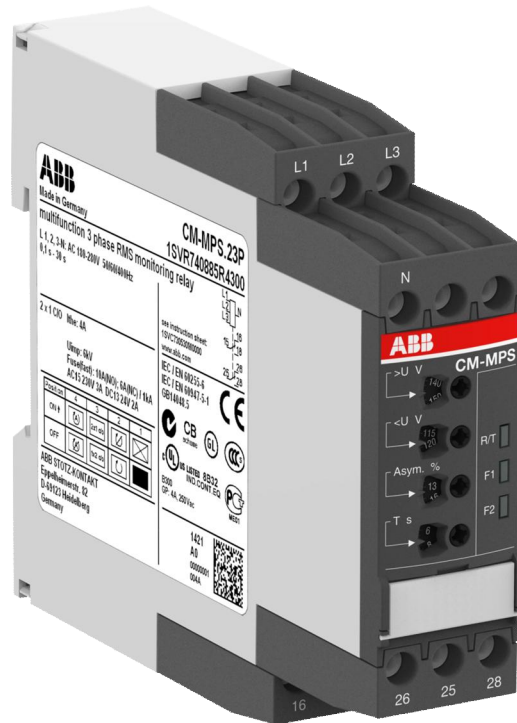
ABB offers Phase monitoring relays which can be used in conjunction with MCB's or MCCB's or even ACB's. Circuit breakers are tripped using shunt trip coil in the event of neutral interruption. This will protect all your expensive 1-phase equipment from over voltage and neutral interruption.

Note – Neutral interruption may not be detected by this relay incase network is symmetrically loaded.