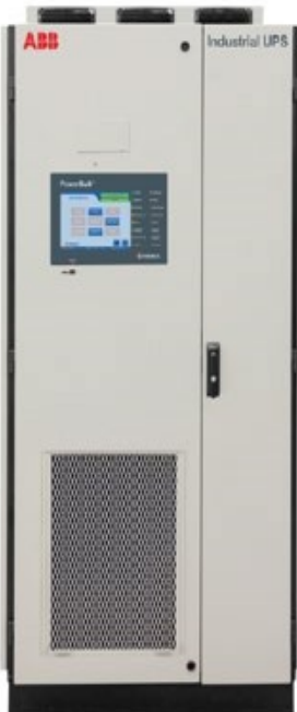
Cyberex® PowerBuilt™ Industrial UPS