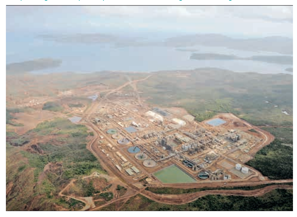
4 Optimizing an entire plant is possible with an ABB long-term service agreement.

as a combination of hardware, software and services that monitor asset conditions to identify potential problems before they escalate.