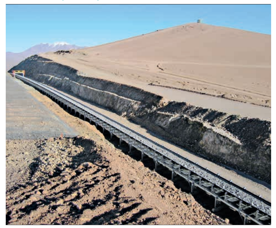
1 Conveyor maintenance is cost-intensive. ABB is currently working on a solution to monitor conveyors remotely.

Productivity in a mining enterprise can be very effectively maximized by the efficient utilization of production assets. This can be achieved through the use of automation, remote operations, diagnostics and production visibility tools, as well as by technologies that provide continuous, real-time information on the condition of mine equipment. A service and maintenance strategy that delivers this is critical for the long-term profitability of any mining company – a fact that ABB has long recognized.