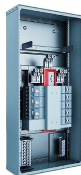
ReliaGear™ neXT Power Panelboards