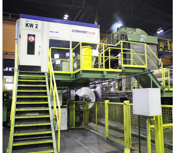
"In February 2014 the DTU had correct and perfect readings and could go into production in KW2 (CRM2)"

The Stressometer System is since 50 years recognized as the world standard in flatness measurement and control in flat rolling mills. Based upon the embedded experience from more than 1000 installations the Stressometer System provides the advanced automated control system needed to produce the high quality flat strip demanded by producers.