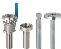
FMT092 – Partial measuring section DN 25 to DN 100