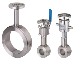
FMT094 – Weld-on adaptor DN 100 and larger