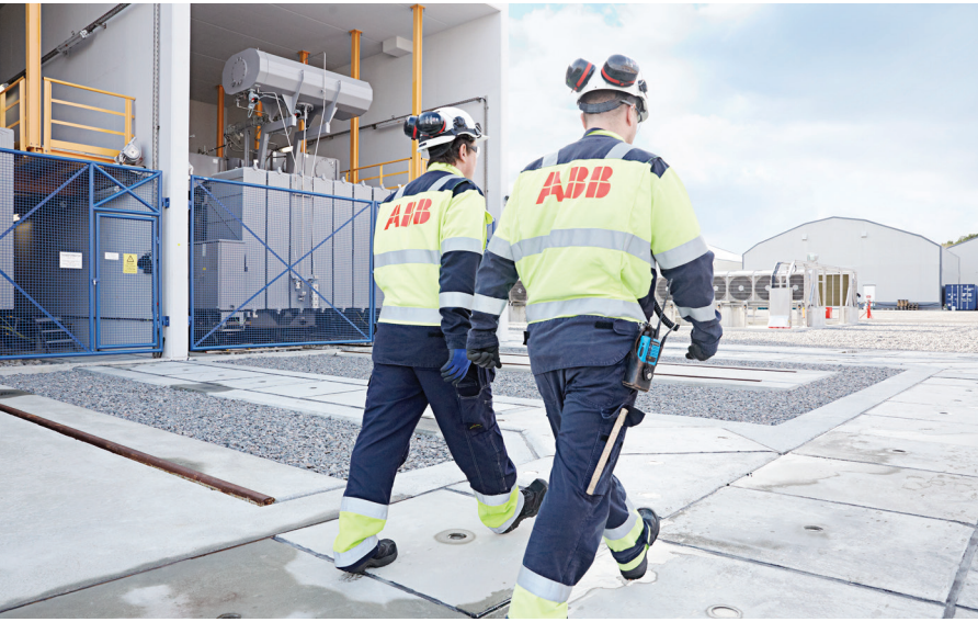
ABB On-site Repair service provides you with the latest drive expertise at the location you need. Your service request is quickly attended to and carried out by ABB-certified service engineers. With On-site Repair service, you can safely minimize production and process downtime.