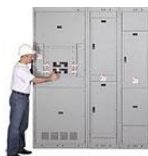
Spectra Series Integrated Switchboard