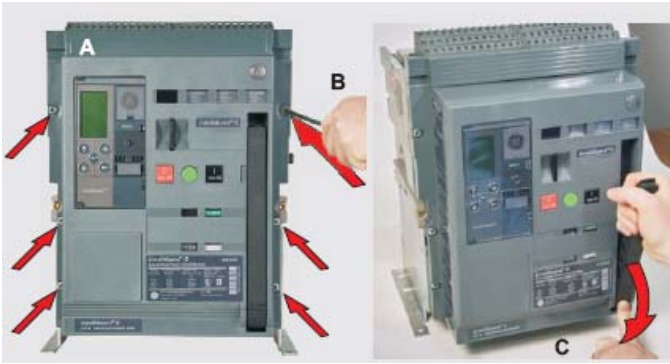
Figure 1. (A) Front Cover (B) Screw Removal (C) Handle Rotation

4. Remove the trip unit from the PMU base.