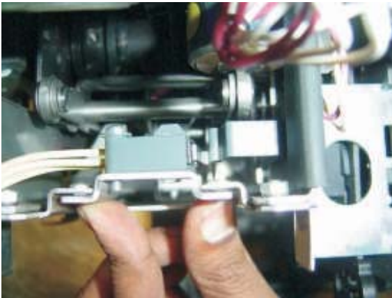
Figure 2: Assembly of Bell alarm

5. While holding the switch lever, slide the bell alarm contact assembly on the PMU base as shown in Fig. 2.