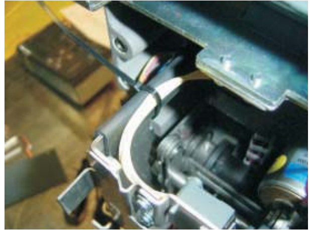
Figure 4. Assembling wire tie

7. Using a wire tie, tie the wires on the PMU base wall as shown in Fig. 4.