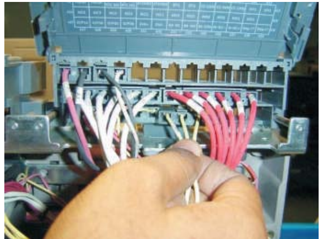
Figure 5. Assembly of connectors

8. Connect the input wire assembly plugs to the terminals A33, A34 & A35 locations marked on the secondary disconnect block A as shown in Fig. 5.