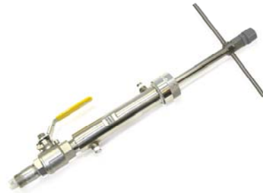
The TB(X)587 includes an extraction housing with flushing ports

The extraction housing has flushing ports which can be used to loosen congealed sugar and particulates. The TB(X)587 or TB(X)557 represent good retractable sensors that work in these processes. Sugar mills should specify the coat resistant "J" Glass electrodes for all carbonation applications. The Wood Next Step Reference can serve for the applications below 11 pH. Teflon should be the material of choice above 11 pH. Measurements should not be made on the carbonation tanks because coating will become a much bigger issue than on flowing pipeline applications.