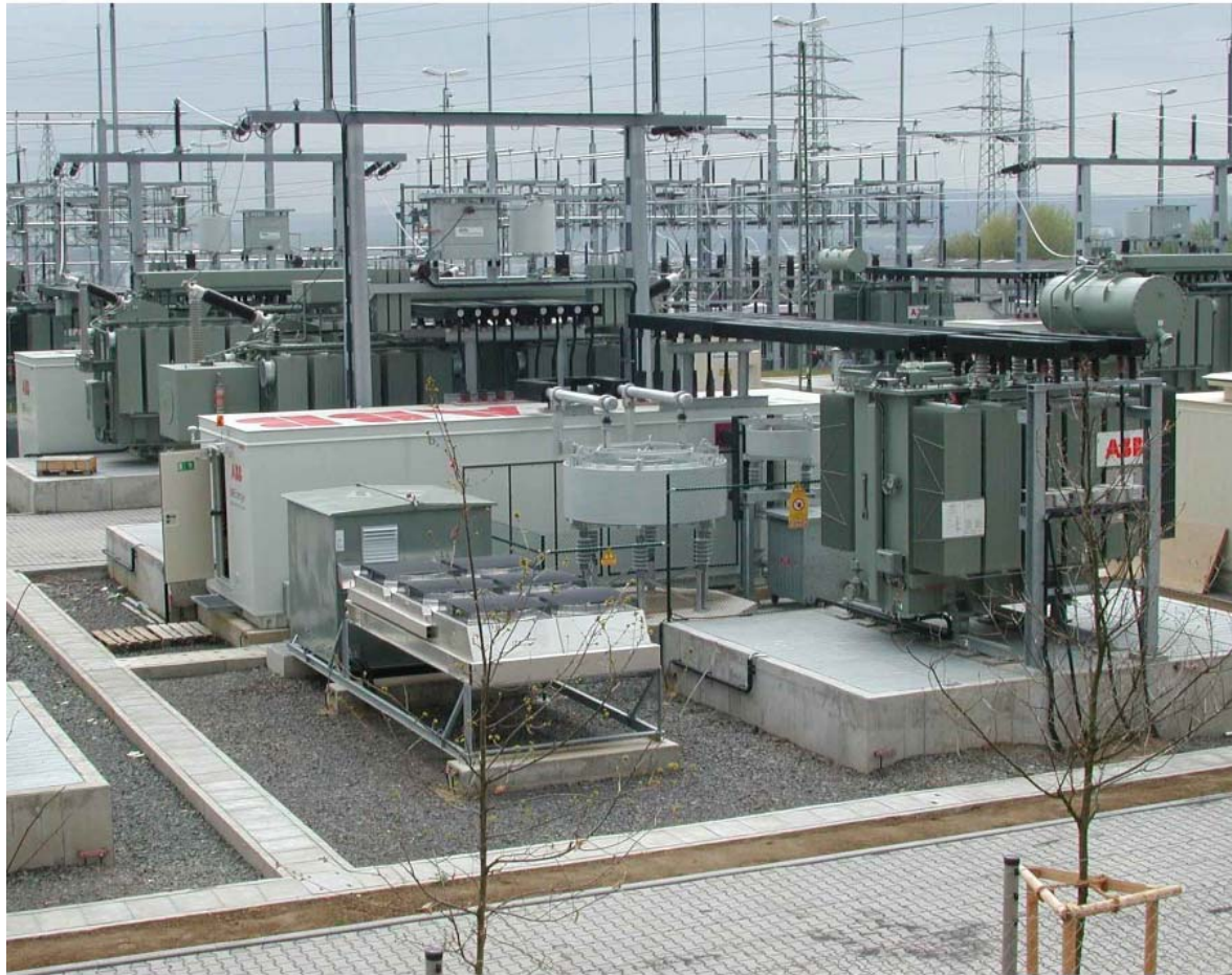
ABB 15-MW - Standard Converter – 8 Units 3AC 20 kV 50 Hz – 2AC 110 kV 16.7 Hz 151.2 MVA / 120 MW