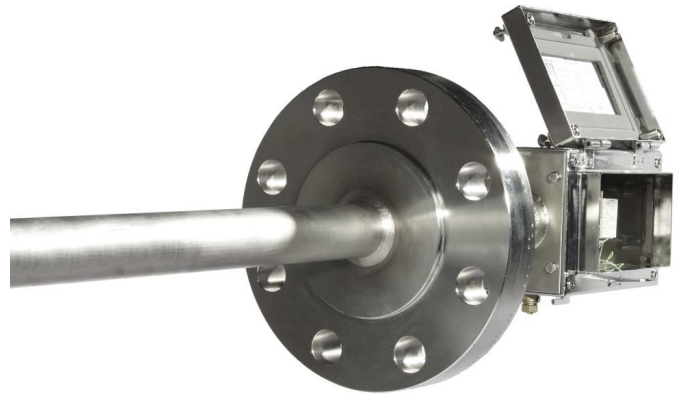
Fig. 3 Custom-designed multipoint measurement system

Fig. 3 shows an ABB multipoint measurement system designed precisely to a customer's requirements. The system includes 3 measurement points, each with 2 sensors, all in a single thermowell.