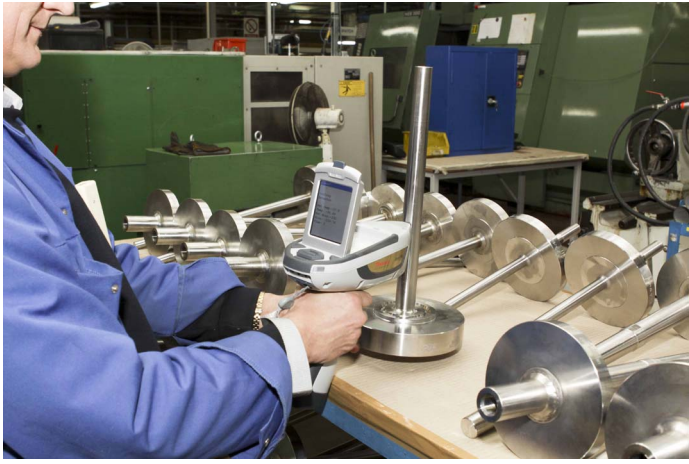
Fig. 2 An ABB operator performing X-Ray PMI on a set of thermowells

Welding procedures must be produced by a qualified welding engineer and verified by a third party (most insurance companies, particularly ones involved in industrial or ship building insurance, have a verification arm). Welders must be qualified to perform the welding procedure required. All of this information must be available and verifiable via a documentation trail. This documentation must then be supplied to the refinery where it is securely retained. Similar verification steps may be required for other wetted parts. Temperature measurement elements and associated transmitters may require a calibration certificate traceable to national standards, although this is not always the case.