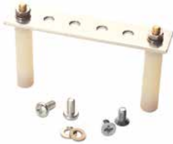
OVR CME Series