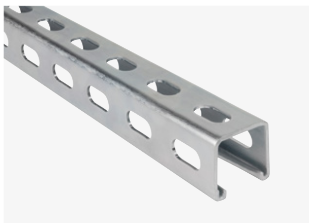
ABB introduces three-sided half-slot channel to its Superstrut metal framing line. Half slots on all three sides of the channel increase flexibility and adaptability during installation. This also enables users to make side-to-side connections and attach various accessories to all sides of the strut.

Half slots on all three sides offer four-sided functionality.