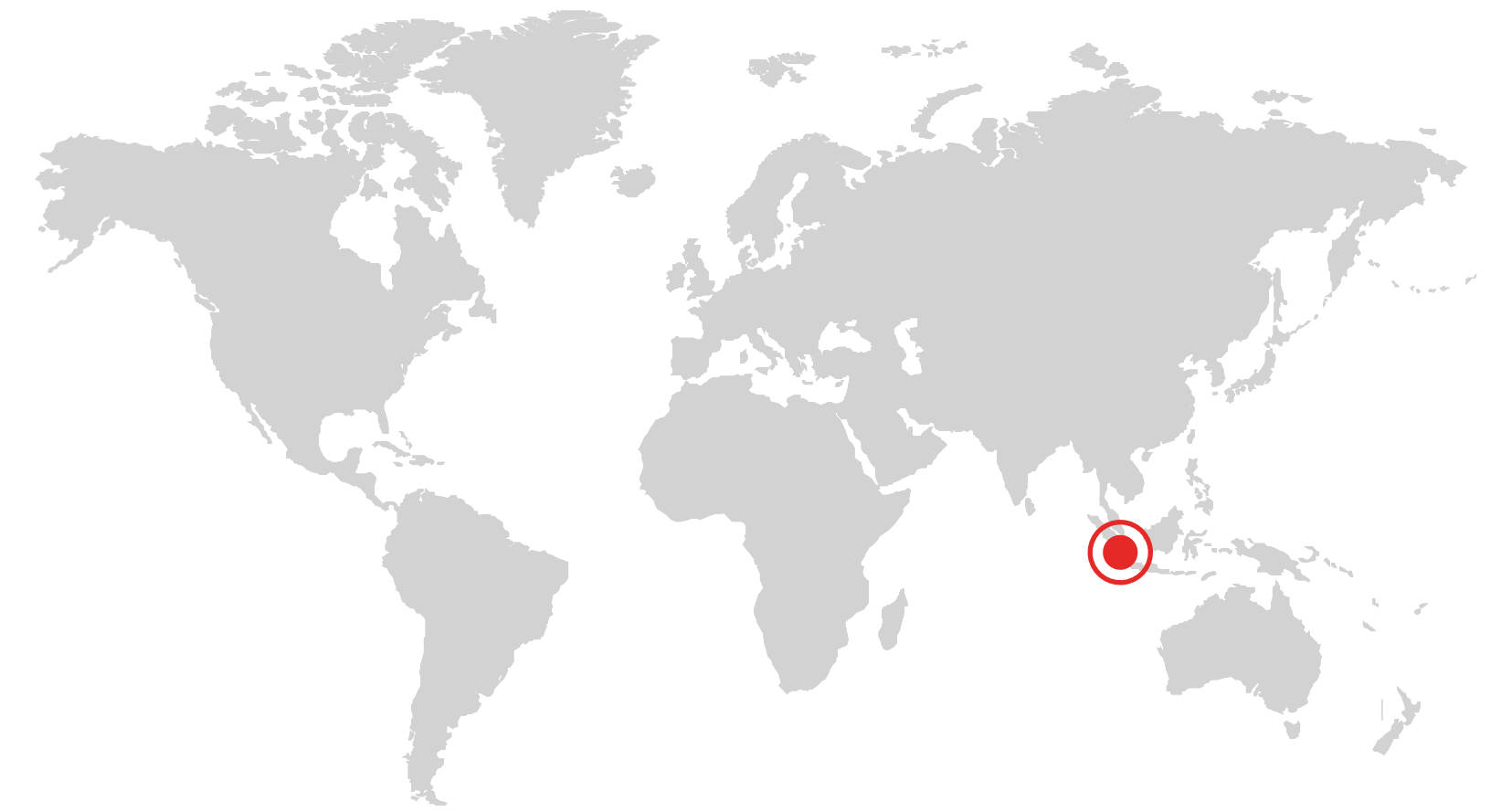
ABB supplies a prefabricated substation to harness geothermal power on Sumatra island.