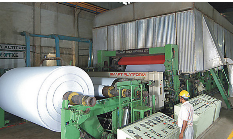
ABB Ability™ Advanced Digital Services reduce sheet breaks and reduce product quality variability by up to 20%. To maximize production, quality and costs management, mill managers wanted to proactively find and correct control issues before they could negatively affect performance.