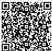
ABB Inc. Industrial Automation Service 579 Executive Campus Drive Westerville, OH 43082-8870 United States E-mail: automation.service@us.abb.com

Performance Optimization for QCS service also indicated the zero gap of the caliper sensor and the measurements of the basis weight sensor were not in the expected range. Additionally, basis weight sensor noise had long-term drift. Mill personnel used this information to improve sensor stability and reduce process variability. This allowed them to establish a proactive system maintenance to avoid unplanned downtime and keep quality production high.