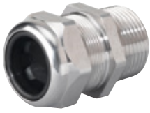
01 2920SST series stainless steel

Extreme cord rage combined with extreme corrosion resistance