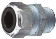
02 2920 series steel/malleable iron in straight, 45° and 90°

Like all Ranger liquid-tight cord connectors, the stainless steel connectors offer twice the cord diameter range of similar connectors, so you can do more with fewer sizes to order and stock. They form a non-slip mechanical grip, providing a liquid-tight seal and the strain relief required for flexible portable cord connections.