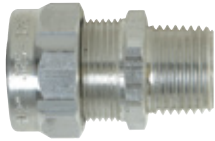
03 2920Al series aluminum in straight and 90°