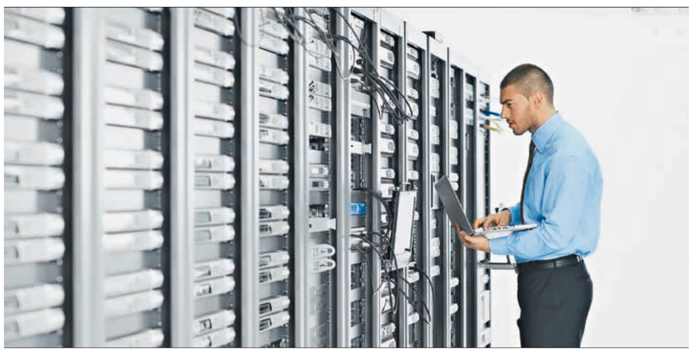
1 Few data centers monitor and control energy consumption.

DCIM systems must be highly reliable and also offer asset management capabilities that go well beyond simply keeping track of servers.