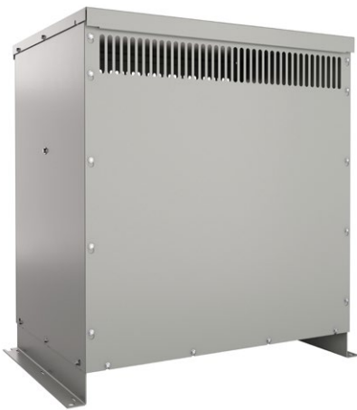
Single and three phase, 15-150 kVA

Instructions for the safe handling, installation, operation, and maintenance of ventilated dry type transformers