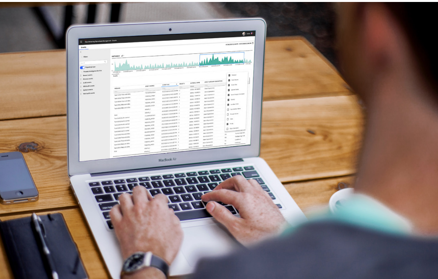
ABB Ability™ Manufacturing Operations Management Events Application

Automations systems continuously collect and store large amounts of process data such as process measurement and many different type of events. To get a complete picture of the process performance, it is essential to explore and understand this large amount of control system process data.