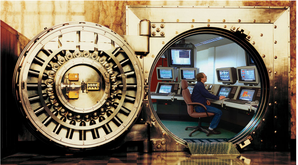
ABB Control Systems