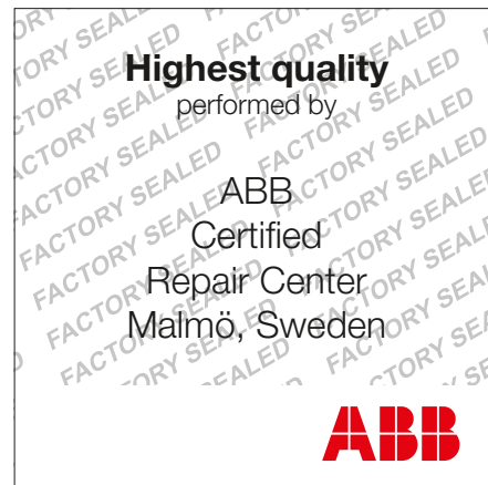
ABB AB Logistics Center, Repair Center SE-205 22 Malmö, Sweden Phone: +46 (0) 21 32 50 00 Emergency Spare parts: +46 (0) 77-1220024, agreement number 9893-499/0 E-mail: repair-center-malmoe.seapr@se.abb.com