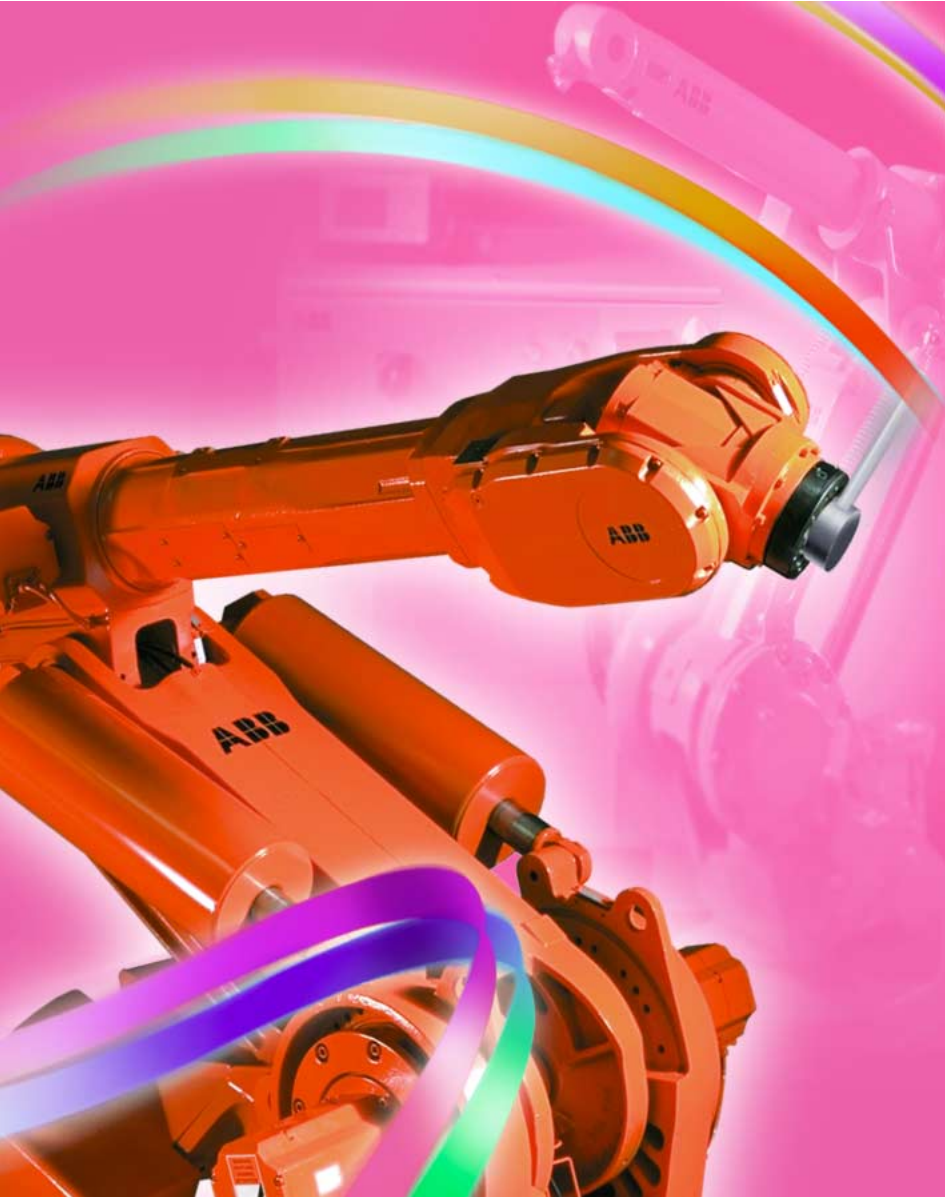
SE 10006 EN/RO

Business Area Flexible Automation Headquarters Switzerland , Zürich +41 1 319 6125