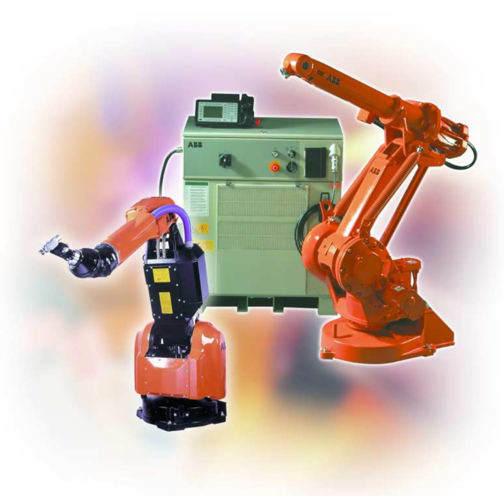
ABB offer new and pre-owned robot automation to give you the optimal solution for your production requirements. For more information on our offer, please contact your local Flexible Automation Centre.

A variety of pre-owned robots are kept in stock and are available for fast delivery to any country.