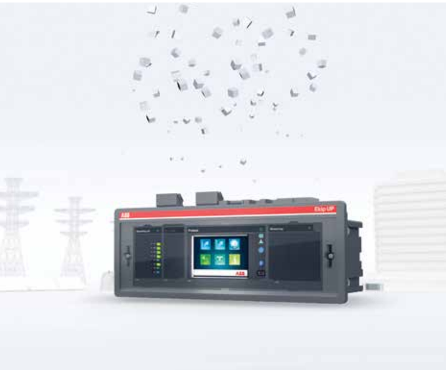
ABB Ekip UP product range works in 5 different versions to gain its capability in many applications for low-voltage systems.

This multi-functionality enables flexible implementations based on specific features.