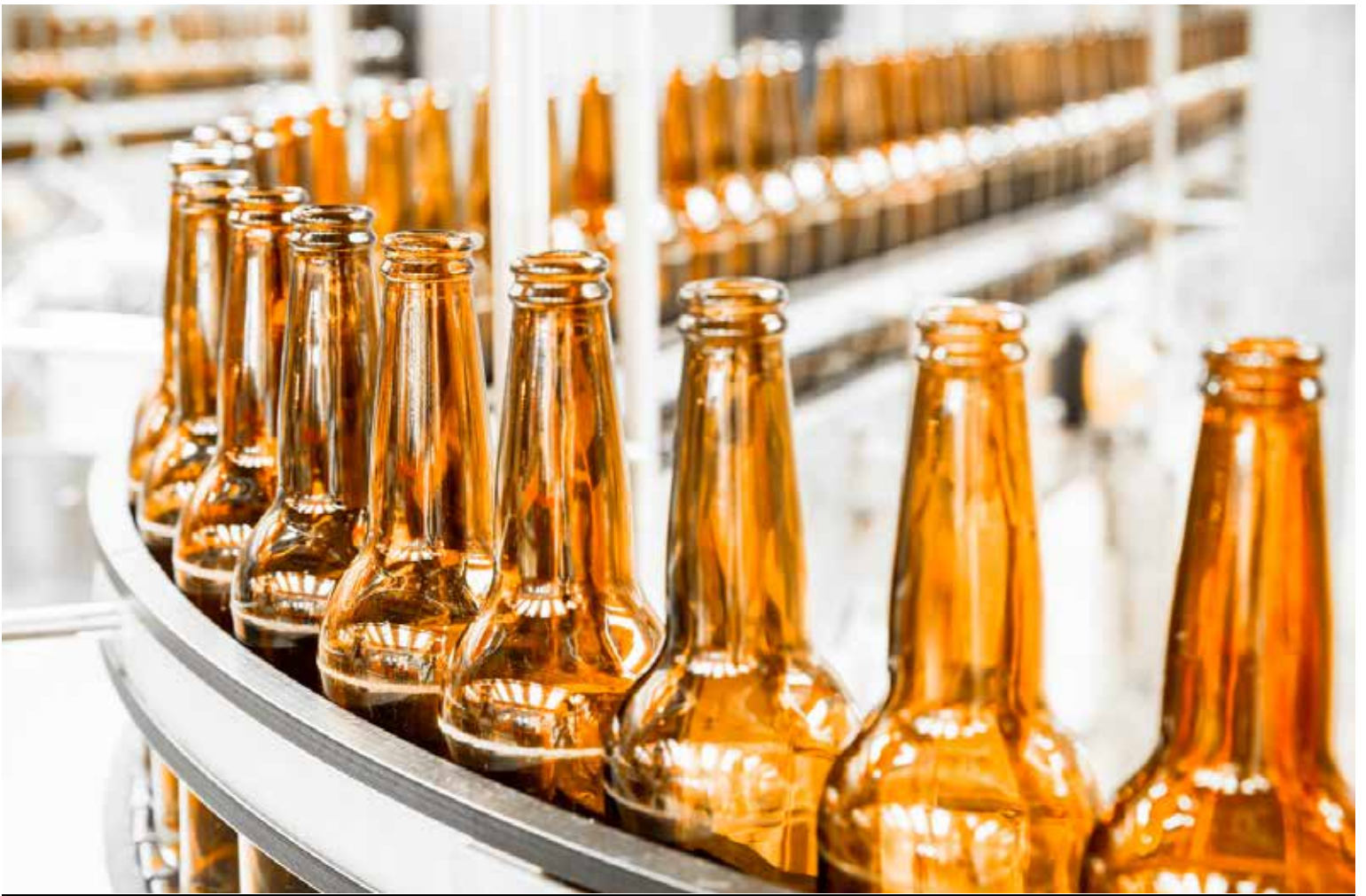
ABB JOKAB SAFETY Products