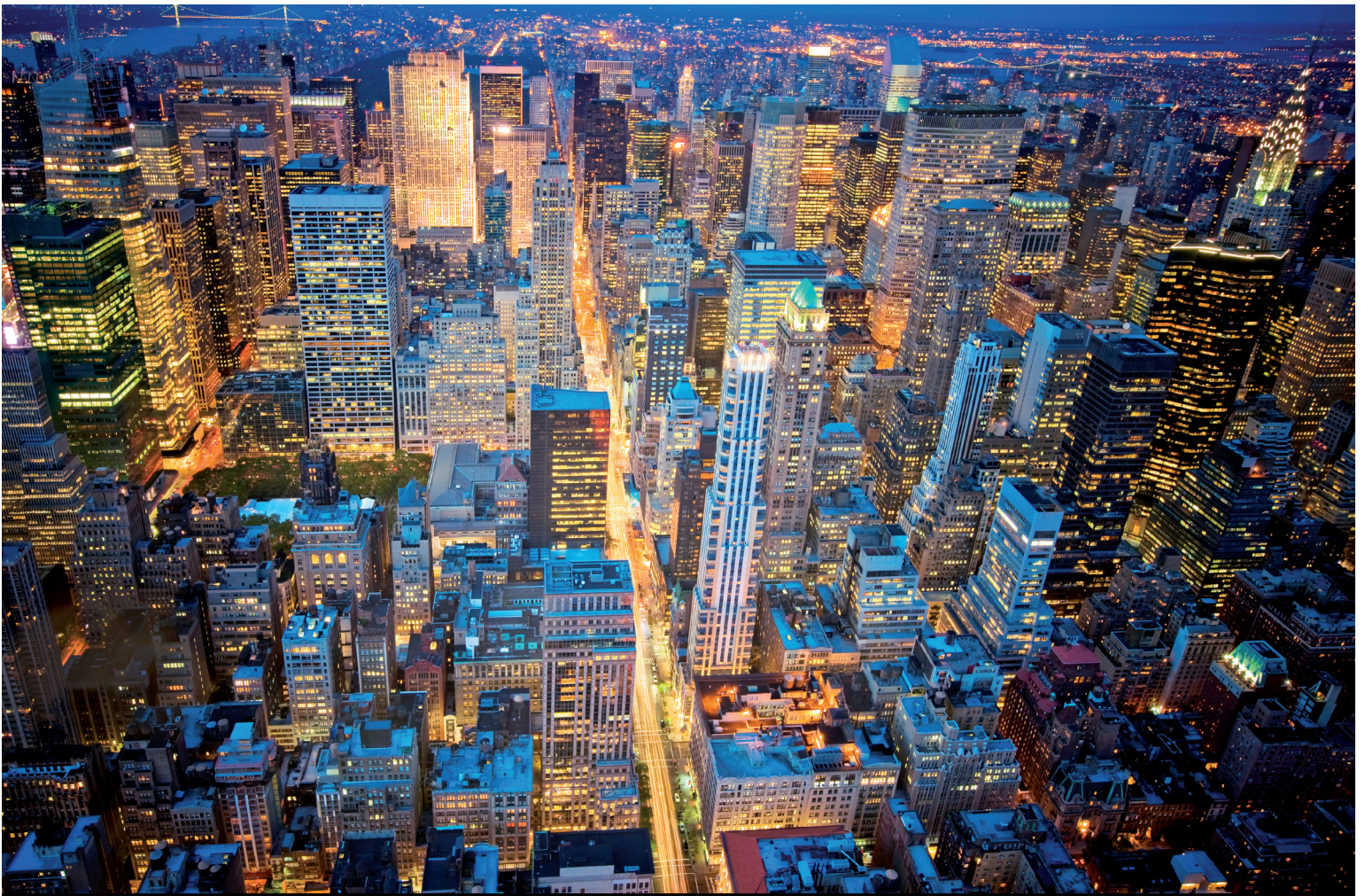
ABB North America