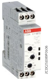
E 234 CT-MFD