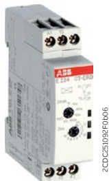
E 234 CT-ERD