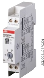
E 232 E-230N