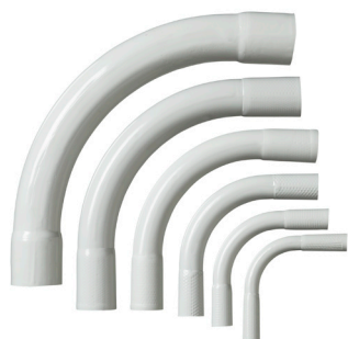
01 Halogen free conduit bends