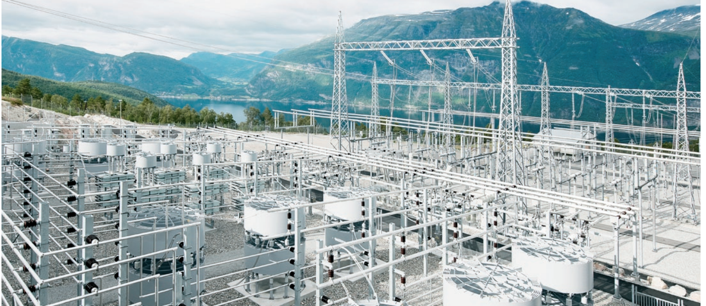
This SVC in Viklandet, Norway, was installed and commissioned by ABB in 2009. The customer was the Norwegian utility StatNett.

ABB FACTS set a new record with 17 commissioned installations around the world in 6 months.