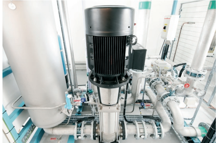
1 TCSC in Raipur, India. 2 SVC Valve 3 Valve Hall 4 Cooling system