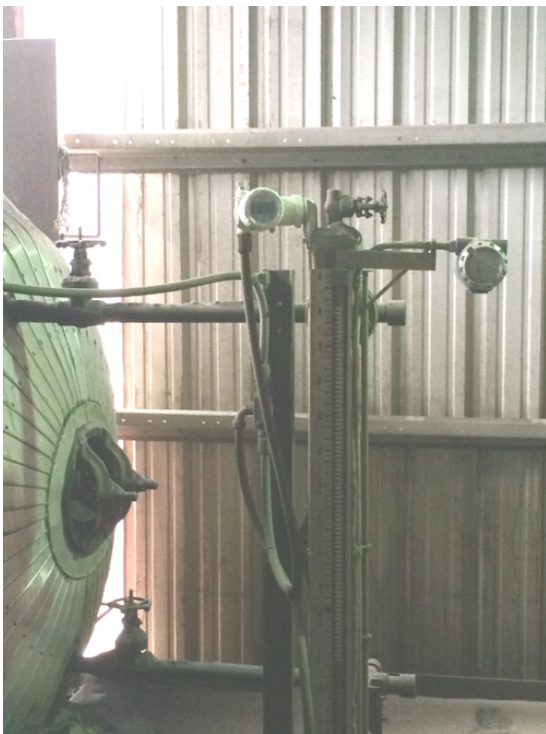
Advanced LMT200 for boiler level measurement

Having successful experience with AT series of magnetostrictive transmitters for decades, the customer did not have any second thoughts in upgrading the boiler level measurement system with ABB's new LMT Series magnetostrictive level transmitter. The customer has installed and commissioned the LMT200 since 2015 and happy with the performance and appreciates the features like the built-in waveform and rotatable housing and display. Also, with the new design of the LMT, the extra 90 degree bend for keeping the transmitter away from the chamber was not required for this high temperature application saving cost and space.