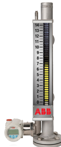
LMT200 bottom mount configuration mounted on the flagship KM26 MLG

*FIELDBUS FOUNDATION™ and FOUNDATION™ are trademarks of the Fieldbus Foundation