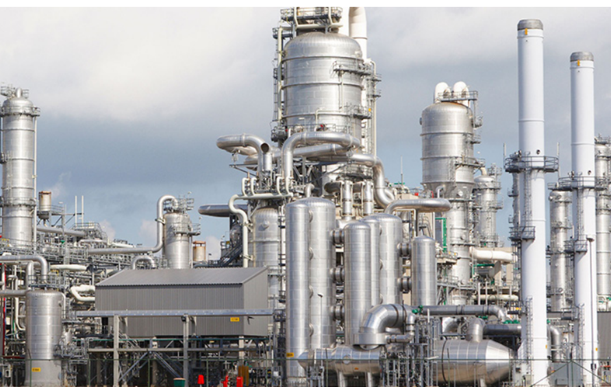
Boiler level measurement and control

Reliable level measurement solutions for extreme applications. LMT series – simple to apply, powerful results.