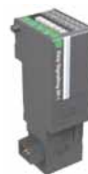
Ekip 2K Signalling module

The Ekip 2K Signalling modules supply two input and two output contacts for control and remote signalling of alarms and circuit-breaker trips. They can be programmed from the trip unit's display.