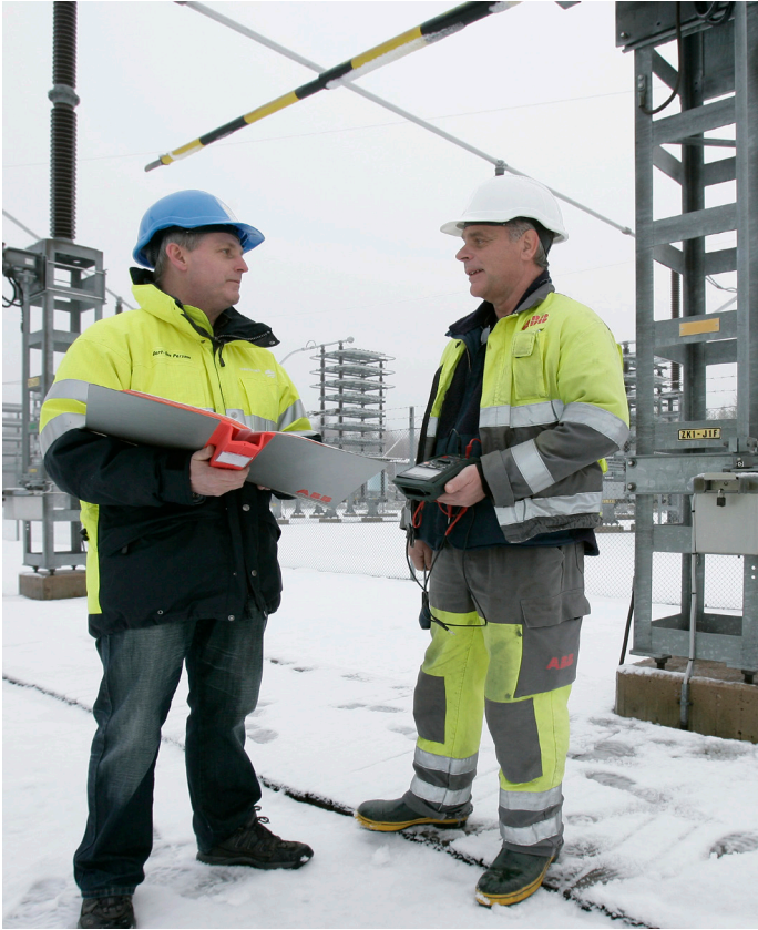
ABB Wireless brings best-in-class, hands-on experience in wireless network integration to its comprehensive professional services offerings. Our team of wireless network experts can accelerate deployment and reduce deployment risks to ensuring customer networks are reliable, secure and ready for operation. They offer field experience with a range of wireless technologies including mesh, point-to-point and point-to-multipoint.