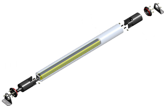
Assembly of the Orion WET and the Orion1B.

Note: Orion WET reduces the nominal operating distance with 10%