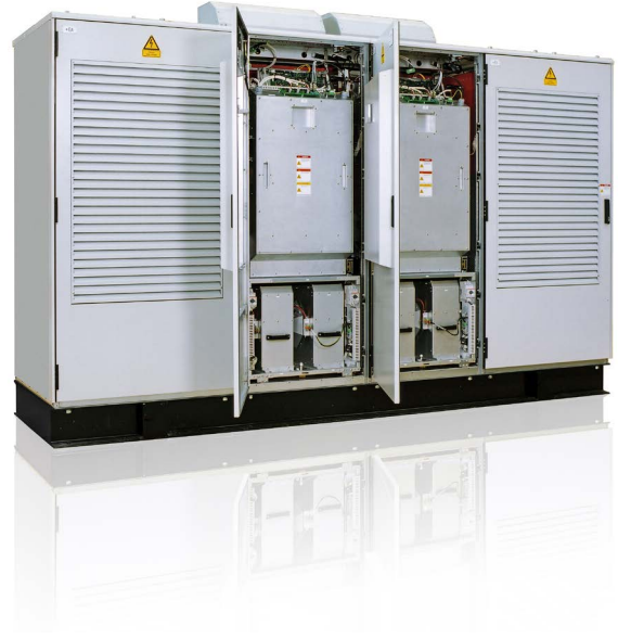
UNITROL power converter UNL 14300 with cover plate