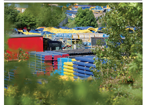
Radius Systems Ltd

Radius Systems, part of the Polyplastic Group of companies, designs, develops and manufactures plastic piping systems for the utilities, telecoms and construction industries. Established in 1969, Radius Systems is the only provider to offer solutions spanning the entire pipe life cycle.