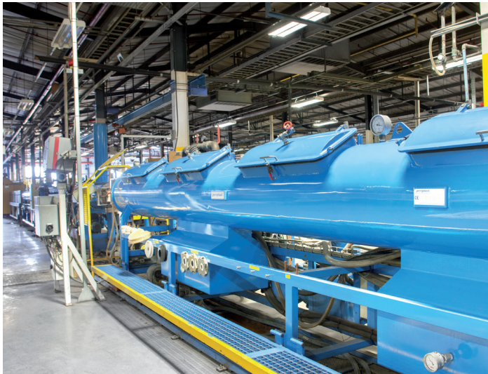
At Radius Systems, traditional DC motors powering extrusion lines are gradually being replaced with AC motors in an effort to improve energy use, lower maintenance and reduce noise.