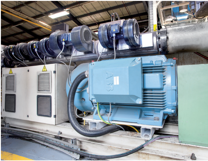
The 200 kW IE4 SynRM motor fits neatly into the space vacated by the DC motor in the extruder.