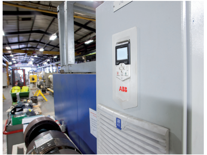
The SynRM motor and drive package proved as effective on the constant torque in extrusion line at Radius Systems as it is on quadratic torque in pump and fan applications.

environmental conditions. For instance, energy consumption is higher on a cold day as more energy is needed to warm up the process.”