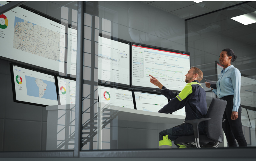
ABB Ability™ Monitoring Service gives users of motors, variable speed drives and their driven equipment access to a network of remotely located ABB technical experts. These engineers proactively track the performance of assets, provide regular reports, trigger early warnings and highlight areas for improvement.

Keeping a watchful eye on all your motor-driven applications can erode time and resources. Handing over the performance tracking of assets not only offers peace of mind but frees your valuable maintenance teams to be deployed on other critical tasks.