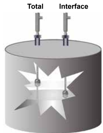
AT500 Sample Applications Total and Interface Measure- ment