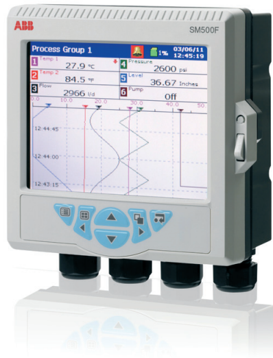
SM500F Videographic recorder

The SM500F is the world's first field mountable paperless data recorder. Featuring seven channels and available with wall, panel and pipe mounting options, it provides a truly simple recording solution that can be used anywhere, anyhow and by anyone. Its fully sealed IP66 and NEMA 4X enclosure means it is ideal for use in even the most hostile environments, including hosedown and dusty applications.