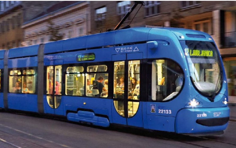
ABB cable protection helps shape new trams on one of the world's oldest operating tram systems

The Zagreb Electric Tram system and ABB forebear Brown Boveri were born in the same year — 1891. Today ABB is helping ZET put modern tram cars on the rails that are more comfortable and more reliable than ever before.