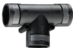
T Piece IP68