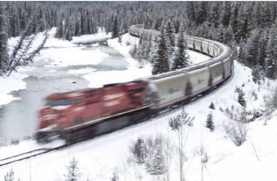
ABB traction motors Locomotive

It is important to identify as many key differentiators as possible for the actual conditions in which the locomotive will be operating. One obvious differentiator is the train's main application, i.e. whether the locomotive will be used for passenger traffic or for hauling freight.