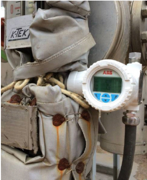
New LMT200 installed on KM26 MLG

Ammonia is a critical part of NOx emission control at power generation facilities and process plants. Maintaining operation and control of the processes controlling NOx emissions is important for the environment, plant operations and avoiding government penalties for excessive emissions. As part of the safety measures, the customer decided to upgrade this level measurement system.