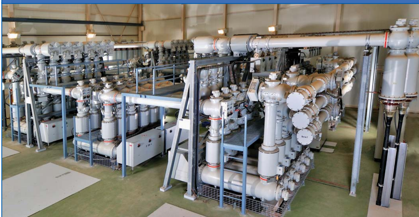
ABB's ELK-14, 300KV rated GIS

ABB's power quality system Switch-syn TM , which has become industry standard for switching large loads within Aluminium smelter substations, will energise all large loads with minimal power distortion impact to the feeding generation plant and the power conversion station.