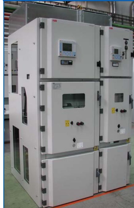
UniGear Type XS1 rated up to 24kV

the GIS and the 33kV switchgear to avoid long cable runs. Also at the EMAL site this was made possible due to a compact substation arrangement.