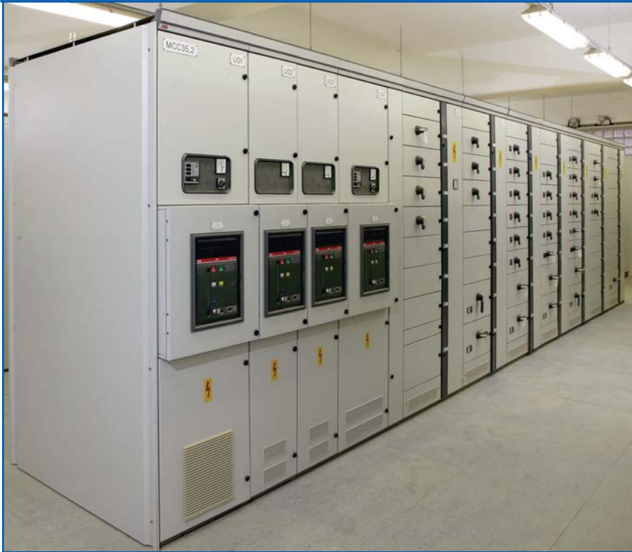
Typical MNS Low Voltage Switchgear

cabling requirements by some 50 tons of copper cables for such a large installation.