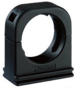
Conduit Clip one-piece with safety lid